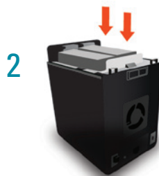
2 Slide 1 or 2 drives into the bays and verify the SATA connectors are aligned.