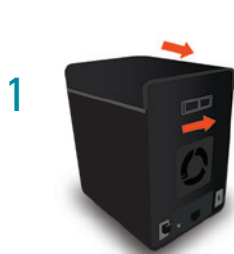
1 Pull up on the front plate.

How do I insert drives into my ShareCenter® device?