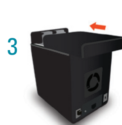
3 To remove drive(s), pull down on rear levers.